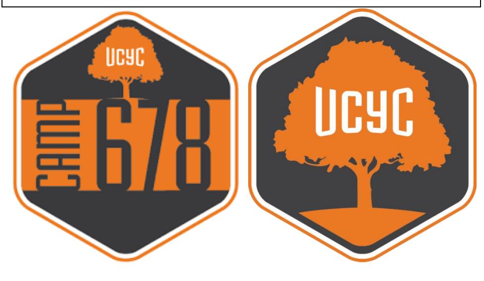
Full & Partial Scholarships available!

Amazing Worship Program Materials 4 Delicious Meals 2 Nights Housing All Fun Activities